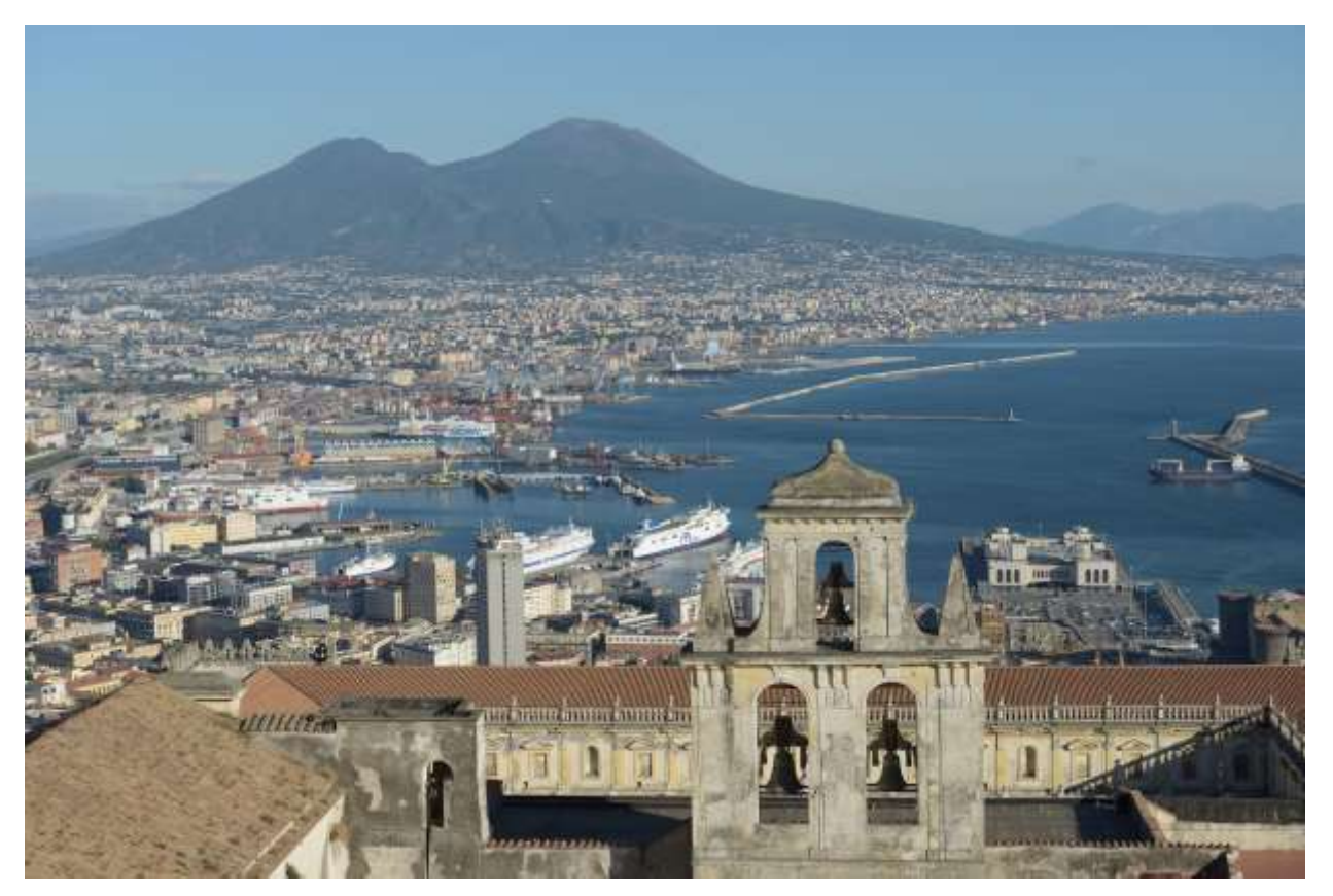
Naples from the Castello Sant Elmo with Abbazia San Martino, the Port and the Vesuvio

Complesso di Santa Maria La Nova Piazza S. Maria la Nova, 44 Naples, – Italy